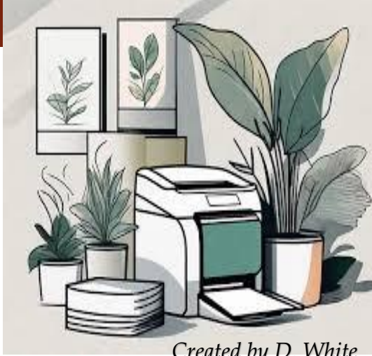
Created by D. White

HOLIDAYS APRIL 1 (APRIL FOOLS DAY) APRIL 24 (ADMIN PROFESSIONALS DAY) MAY 12 (MOTHER'S DAY) MAY 27 (MEMORIAL DAY) JUNE 16 (FATHER'S DAY) JUNE 19 (JUNETEENTH) BOARD MEETING APRIL 25, 2024 MAY 23, 2024 JUNE 27, 2024